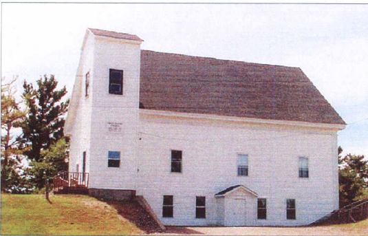
ABOVE: FIRST BAPTIST CHURCH , BUILT IN 1865 BELOW: AFTER FIRE LEVELS FIRST BAPTIST CHURCH ON OCTOBER 29, 2012, NEW CONSTRUCTION BEGINS.