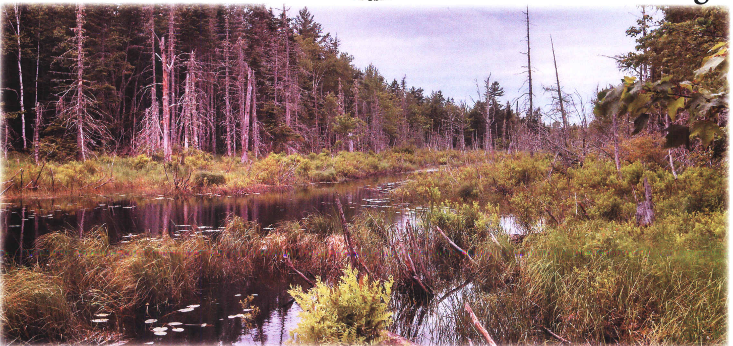
MEADOW BROOK COORDINATES 44.57.35 NORTH 67.11.23 WEST