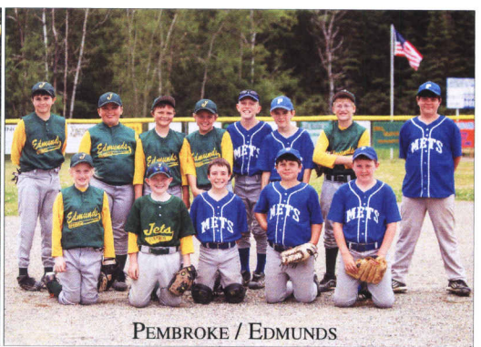
PEMBROKE / EDMUNDS