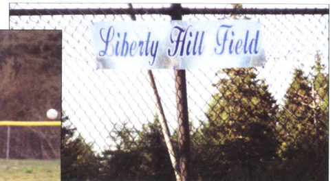
NEW BALL FIELD